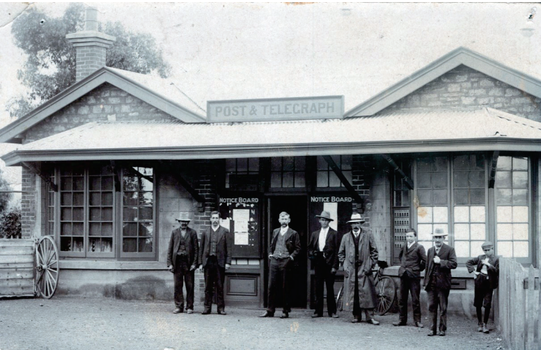
From Days Gone By - Narrogin's original Post and Telegraph Office in 1908. By 1912 the current Post Office has been constructed next to the original. The two stood side by side for some time, before the original building was demolished.