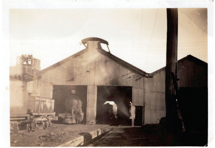
From Days Gone By – The Locomotive Sheds at Narrogin Railway Station. 1948 - 1950

The Council resolved to make superannuation contributions for