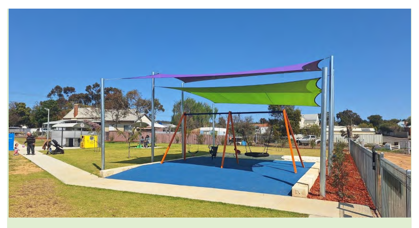
UPGRADES AT LIONS PARK NARROGIN TO INCLUDE DISABILITY-FRIENDLY SWINGS