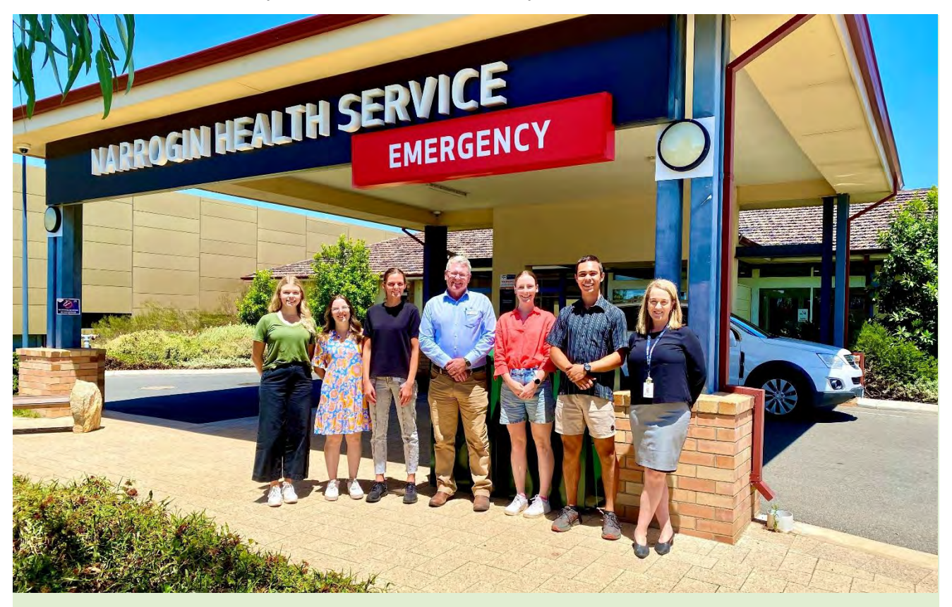
RURAL CLINICAL SCHOOL WESTERN AUSTRALIA NARROGIN MEDICAL STUDENTS 2024

To further support staff and volunteers, the Shire implemented enhanced processes and resources, including the regular replacement of vehicles and the acquisition of new equipment, ensuring a reliable fleet and the tools necessary for effective service delivery.