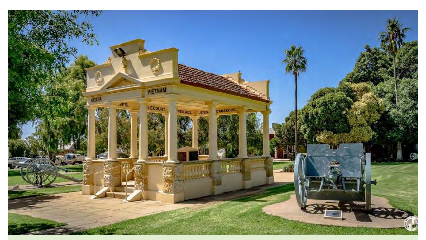
NARROGIN WAR MEMORIAL PAVILLION, MEMORIAL PARK