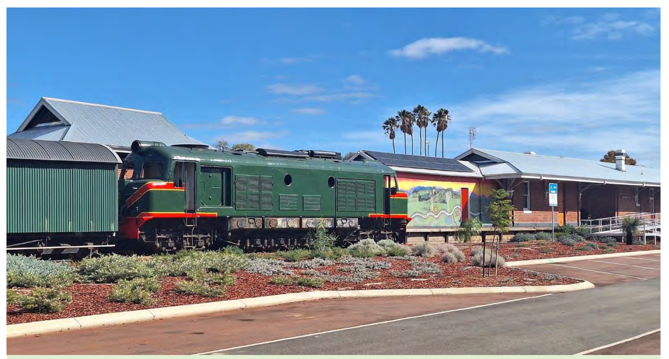
XA CLASS LOCOMOTIVE XA1415 AT THE HISTORIC RAILWAY STATION AND NARROGIN & DRYANDRA VISITOR CENTRE