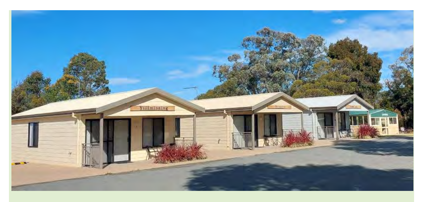
THREE ADDITIONAL MODERN CHALETS AT THE CARAVAN PARK