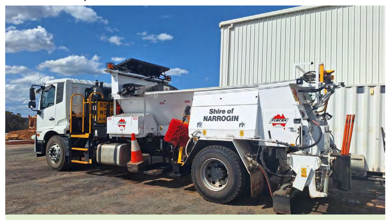
THE SHIRE OF NARROGIN'S ROAD DEFECT FLOCON UNIT

These initiatives demonstrate the Shire's commitment to fostering a safer, more inclusive, and connected community.