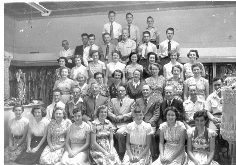
From Days Gone By – Foy's Department Store staff - Dec. 1953

Interpretation is a vital element for any place of cultural heritage significance, as it seeks to tell stories about what makes it significant and provokes