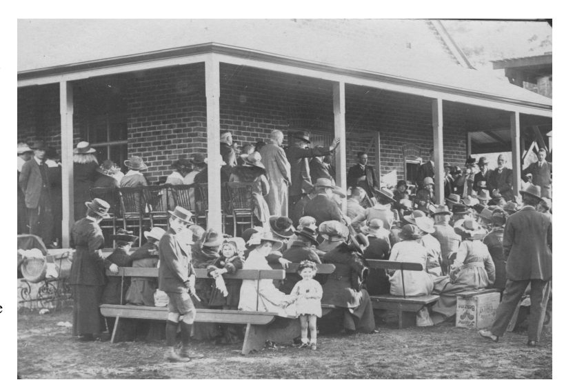
From Days Gone By - Taken in 1919, everybody is dressed in their finest, furs, hats, suits and ties at the opening of the Old Butter Factory.

Congratulations to Round 1 applicants: the Menshed received $3,849 for a new fridge and vehicle hoist; Narrogin Cottage Homes, $5k for governance training for volunteer board members; the Croquet Club, $2,498 towards