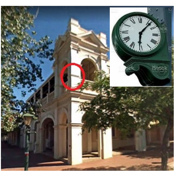
2. Proposed location of industrial railway clock

Extracted from a phone call and emails with Mr Markerink is the following commentary: