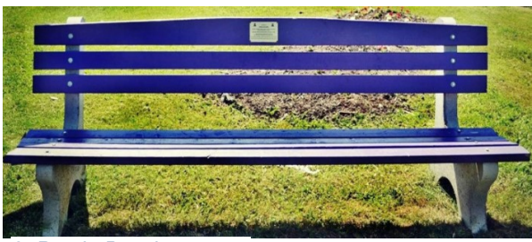
2. Purple Bench