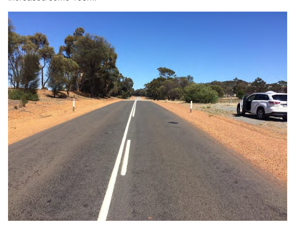
Visibility from the east is now a distance of some 400 – 500m

Standing in the proposed location of the new driveway the visibility from the west has increased some 100m.