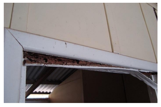
Internal Club rooms white ant damage