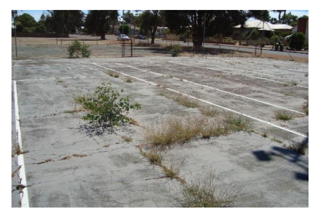
Tennis Court Playing Surface