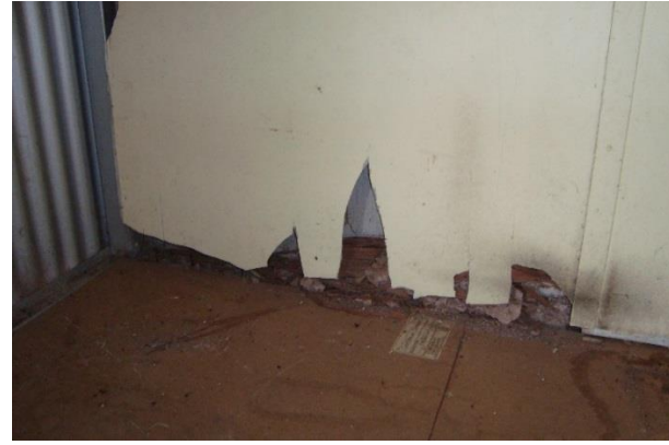
Internal club rooms white ant/asbestos damage