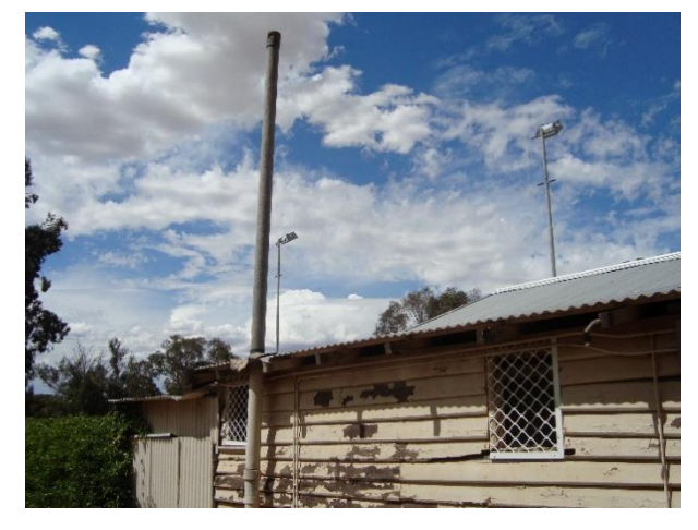
Tennis Court club rooms rear