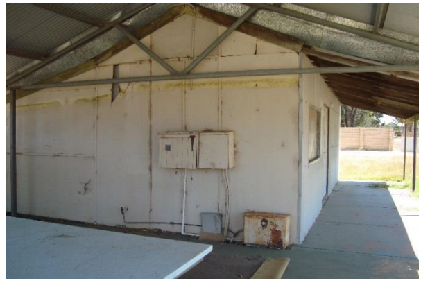
Tennis Court Club Rooms